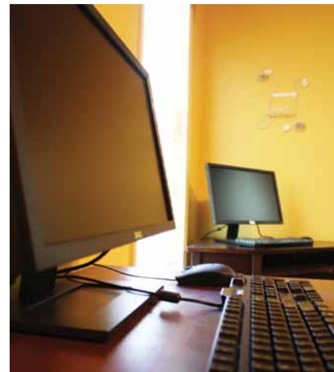
New technology is now available for the girls to continue growing as our world goes high-tech.

Grace House has been very pleased with our school partnerships, and education continues to be a primary focus for the organization. We know that each girl reaching her potential academically is the best way to break the cycle of abuse and see the girls continue the forward momentum they establish while living at Grace House. GH