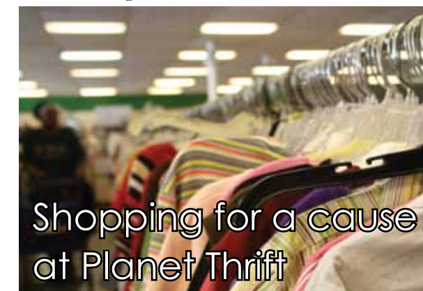
Shopping for a cause at Planet Thrift