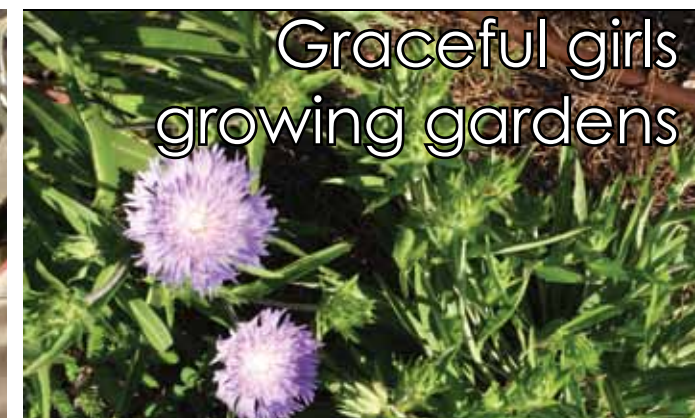
Graceful girls growing gardens