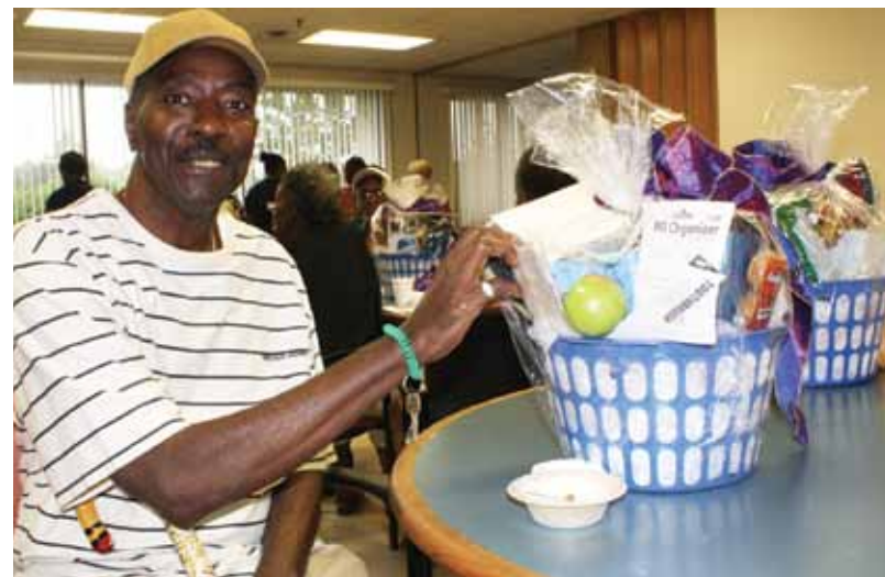
Princeton Towers resident with the gift basket he won from Grace House in a drawing